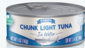
TUNA Chunk Light in Water