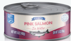
PINK SALMON Pink Salmon in Water