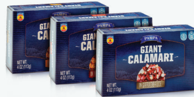
CALAMARI In Oil / In Garlic Sauce / In Marinara Sauce