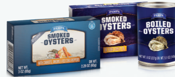
OYSTERS Smoked / Boiled