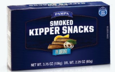
KIPPER SNACKS Smoked in Brine