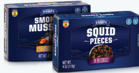
SQUID Pieces in Ink Sauce