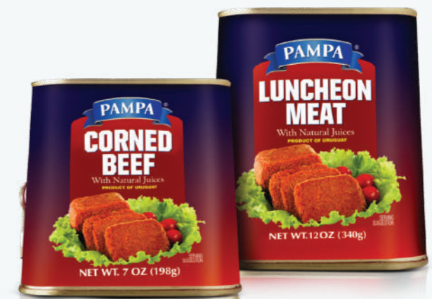
CORNER BEEF LUNCHEON MEAT