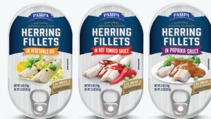
HERRING FILLETS In Vegetable Oil / In Hot Tomato Sauce / In Paprika Sauce