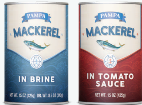
MACKEREL In Brine / In Tomato Sauce